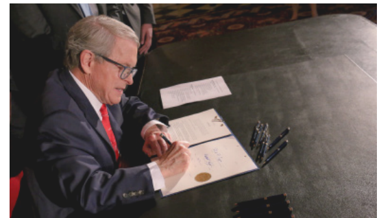
Governor Dewine Signs Senate Bill 56 which would regulate the use of indemnity provisions in contracts related to public improvements.