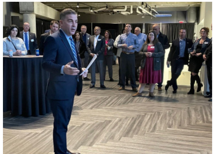
Congressman Mike Carey