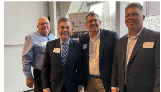
PAC Kickoff Event at COSI