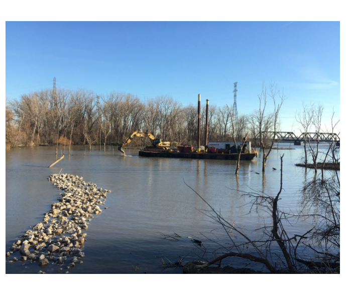
Maumee River Habitat Restoration at Penn 7, Verdantas