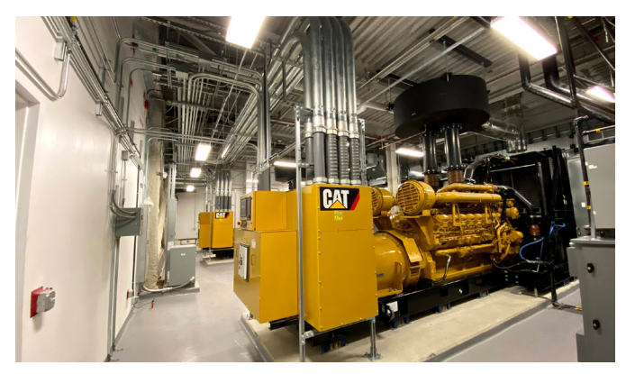
H Building Infrastructure Upgrades, Karpinski Engineering