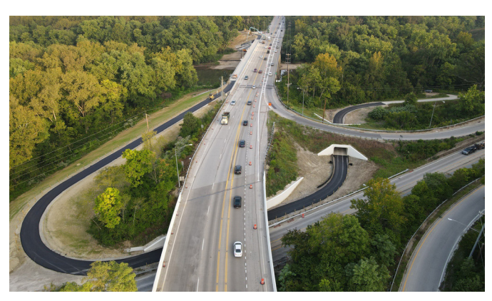
Little Miami Scenic Trail - Beechmont Connection, IBI Group