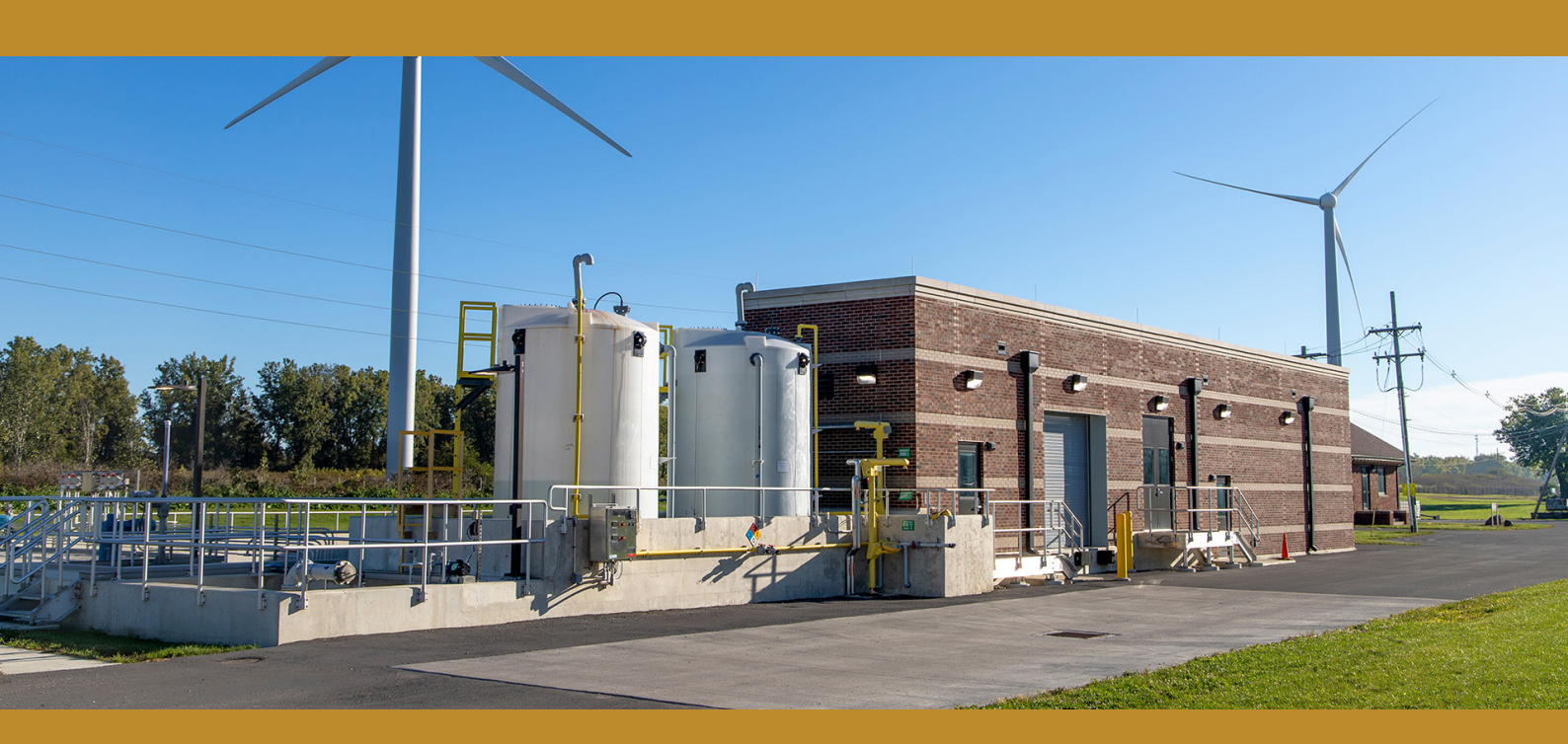
LTCP Phase 1 Water Pollution Control Center Enhancement Project, Hazen & Sawyer

Entry rules and guidelines for the ACEC National competition can be downloaded here.