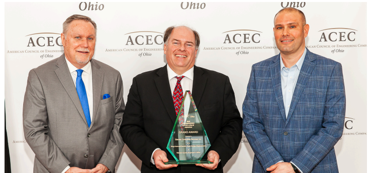
2025 EEA Grand Award Winner, Stantec