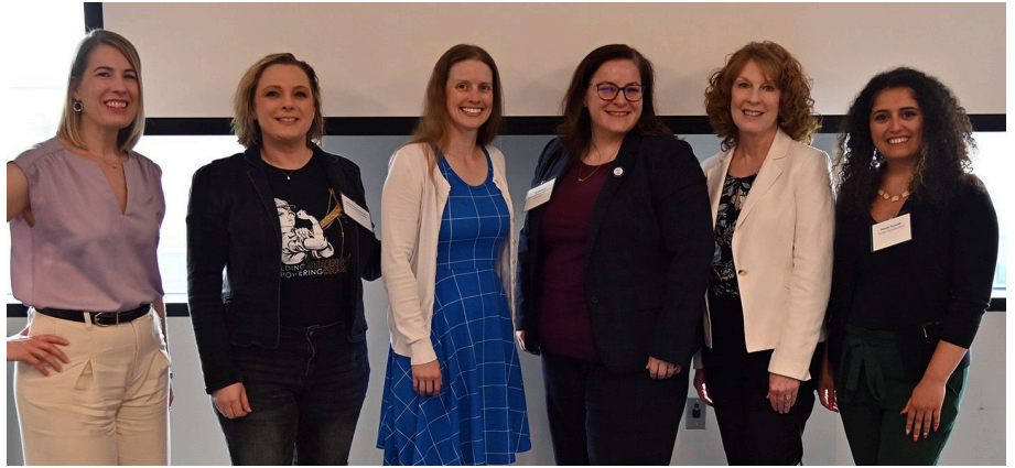
Women in Leadership Event hosted in collaboration with WTS Columbus and NAWIC Columbus